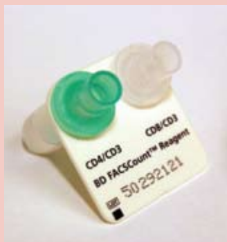
BD FACSCount Reagent Kit (Cat. No. 340167)

Thousands of healthcare workers in more than 50 developing countries have participated in the BD workshops, resulting in a significant improvement of clinical and laboratory services.