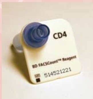
BD FACSCount CD4 Reagent (Cat. No. 339010)

This reagent delivers absolute CD4 counts and CD4 percentages.