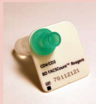
BD FACSCount CD4/CD3 Reagent Kit (Cat. No. 342512)

This reagent delivers absolute CD4 counts and CD4 percentages.